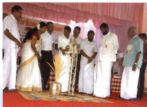
Inaugural function of the North Academic Block