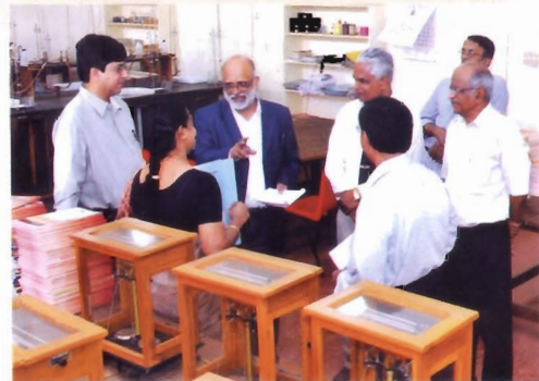
Institution of Engineers (India) Accreditation team on their visit to the college

A panel of three experts visited the college during 2 nd and 3 rd June 2009 for the purpose of accreditation of EEE, ECE, CSE, and ME branches by Institution of Engineers (India).